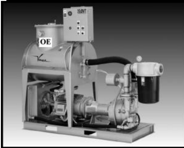
Above OEVmax Model 750k, 750 cfm (50 hp) oil-sealed pump with the DX-5 air/oil separator.