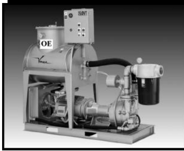
Above OEVmax Model 750k, 750 cfm (50 hp) oilsealed pump with the DX-5 air/oil separator.

Liquid-Ring Vacuum System and ONION ENTERPRISES